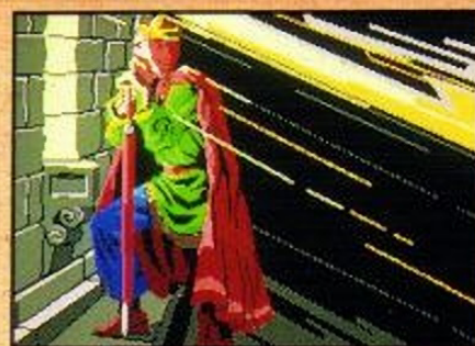
As King Arthur, the weight of the world rests on your shoulders as you contemplate the task that lies ahead.