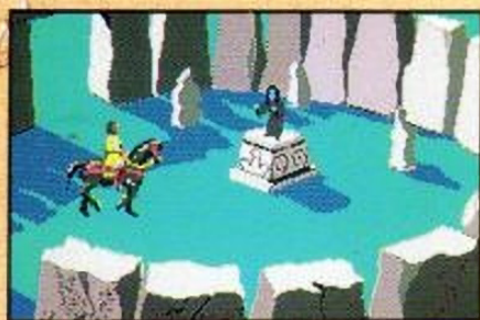
You'll journey to places of ancient mystery.

king and breathe life into a dying land. More than all these things, it is a symbol of the trials of body, mind and spirit that all people face in their search for meaning and truth. Come with us to Camelot as the legendary King Arthur sets out on his ultimate quest.